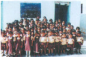
Free School for BPL Children's