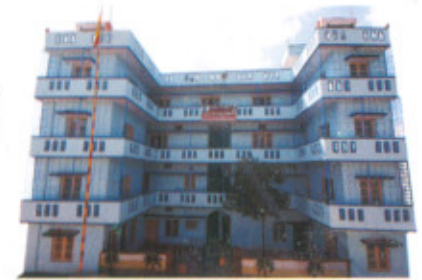
Home for Special Kids at Bangalore Near Bangalore University

Courtesy foundation provides basic needs as food, clothing, shelter, education and medical services.