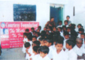
Children's studying in our Library