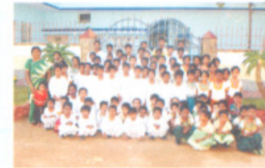
Special Kids at Bangalore with their Teachers and Staffs.