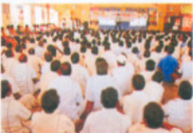
Aids Awareness Camp at Central Prison